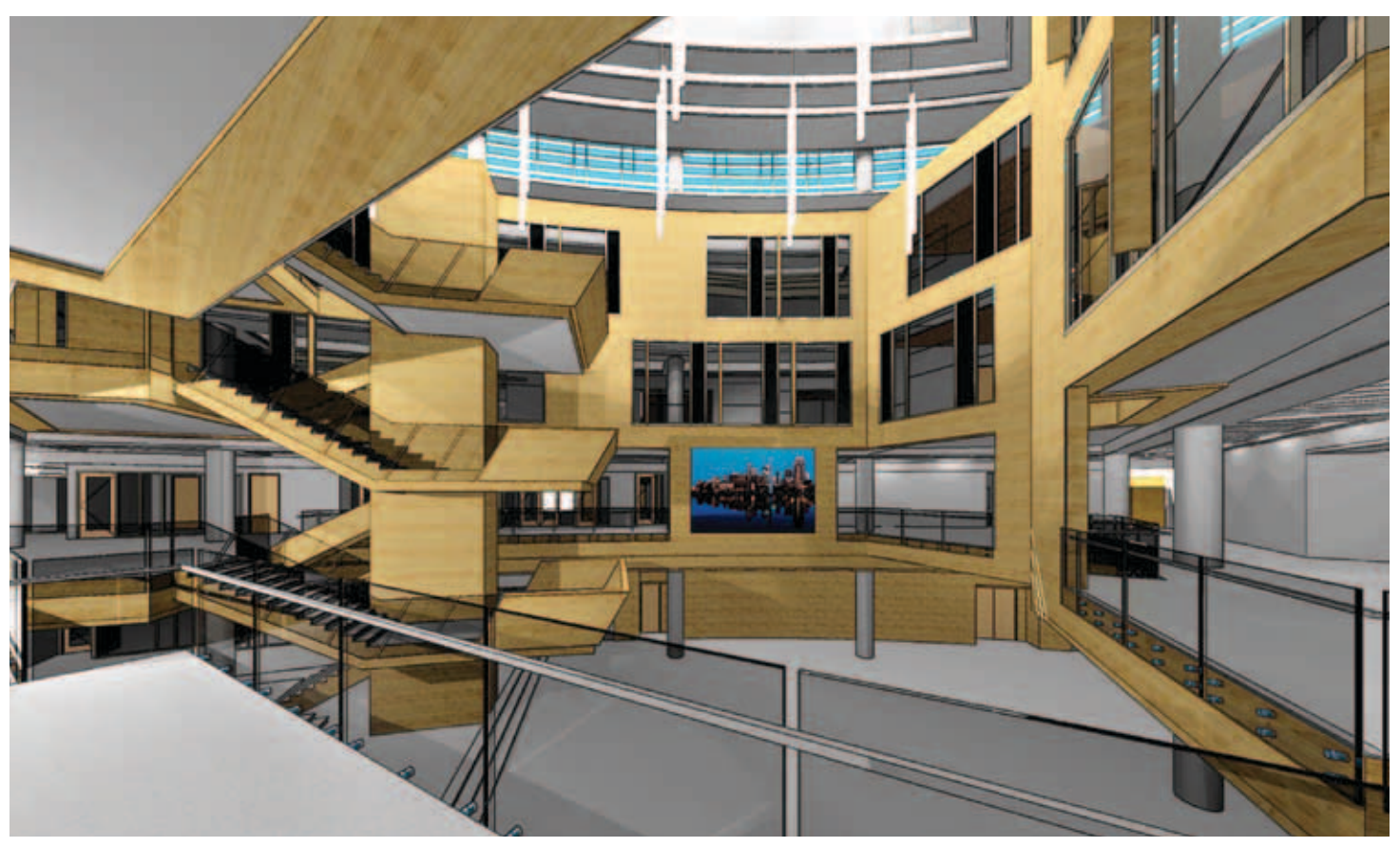
Computer rendering of the Zilber Forum in Eckstein Hall.