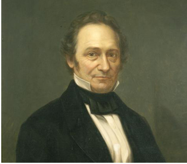
Portrait of James Doty, whose career included service as judge and as governor of the Wisconsin Territory.