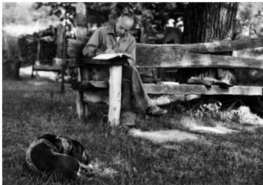
Living on, learning from, and writing about the land and water, particularly in central Wisconsin, led Aldo Leopold (above and below) to become a central figure in building environmental consciousness.