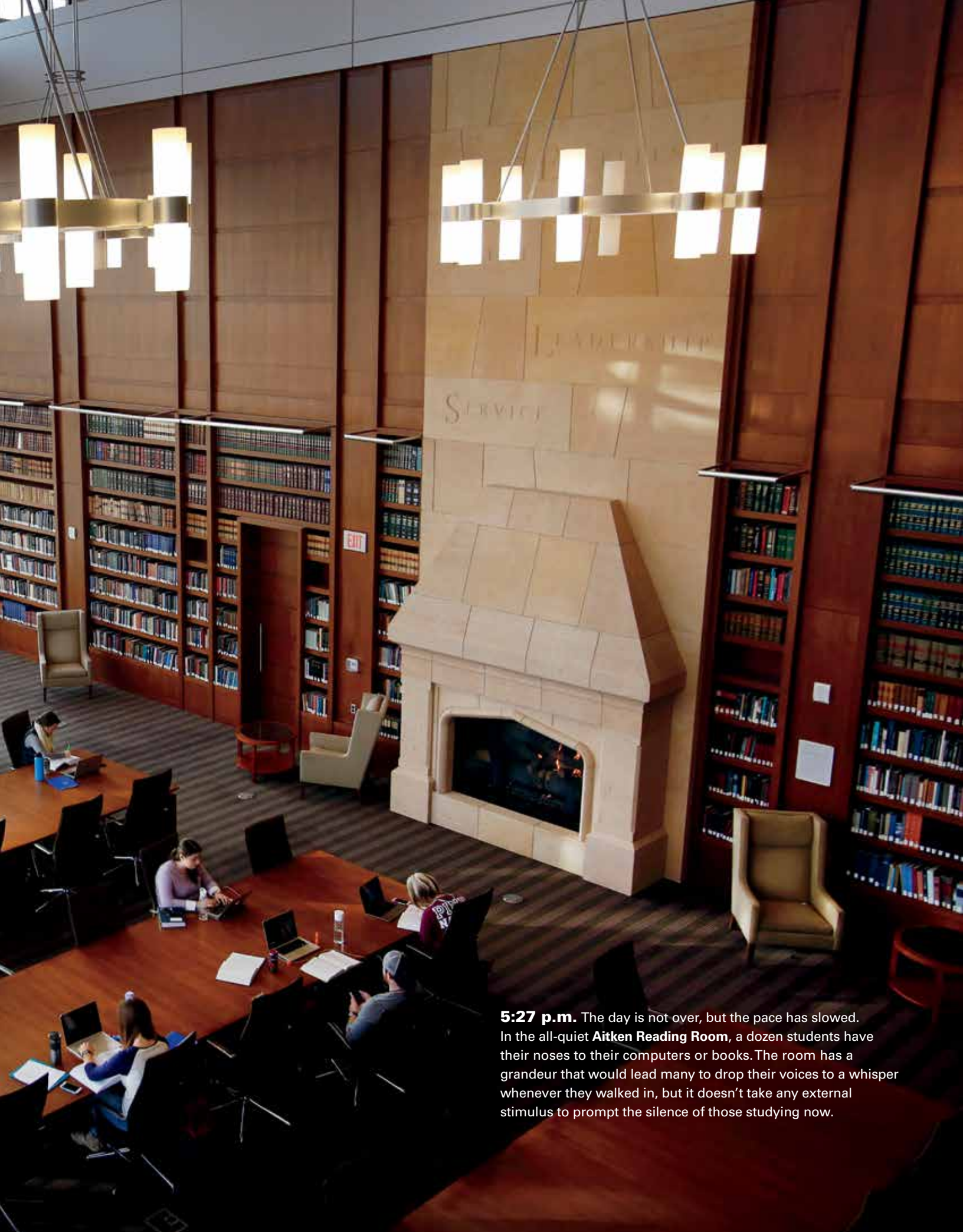
5:27 p.m. The day is not over, but the pace has slowed. In the all-quiet Aitken Reading Room , a dozen students have their noses to their computers or books. The room has a grandeur that would lead many to drop their voices to a whisper whenever they walked in, but it doesn't take any external stimulus to prompt the silence of those studying now.