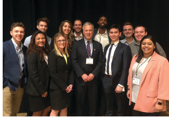
Sports Law Society members at the 2019 Sports Lawyers Association conference

The Sports Law Competition Board hosts a fall collegiate athletics, a spring professional sports negotiation competition, and coordinates student participation in various national competitions. Only Sports Law Certificate candidates may participate in national sports law moot court, arbitration, and negotiation competitions.