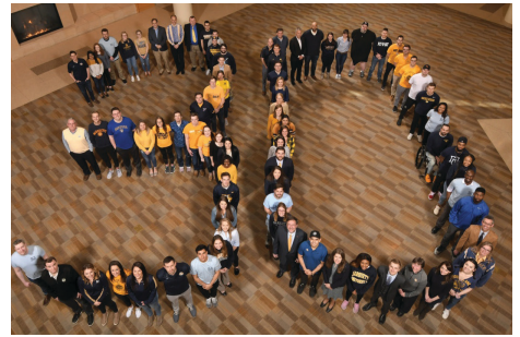
Celebrating the 30th Anniversary of the Institute in 2019