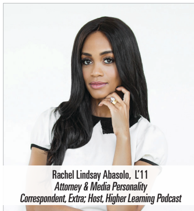
Rachel Lindsay Abasolo, L'11 Attorney & Media Personality Correspondent, Extra; Host, Higher Learning Podcast