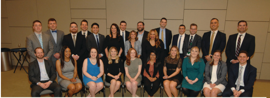
Sports Law Certificate class of 2019