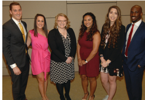
2019-2020 Marquette Sports Law Review editorial board