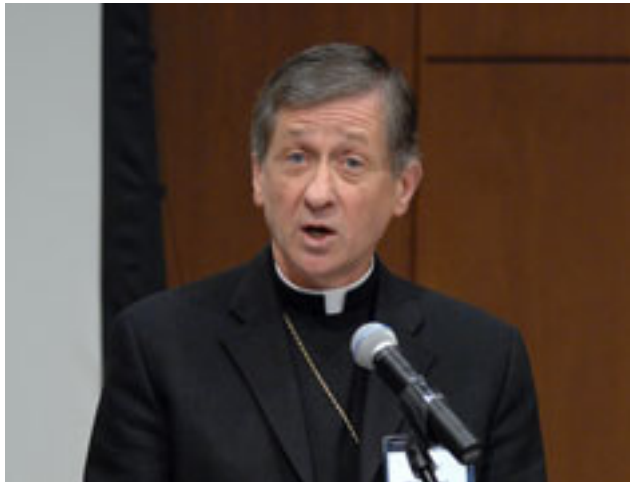
Bishop Blase Cupich U.S. bishops need to continue to recall what

Martin gave personal expression to what Spokane, Wash., Bishop Blase Cupich, chairman of the U.S. bishops' Committee for the Protection of Children and Young People, described as a need to maintain a "visceral connection" to the pain and damage done to those abused by priests. Speaking at the conference, Cupich said that bishops need to remain "at that soul-searching level" or risk "regression or complacency."