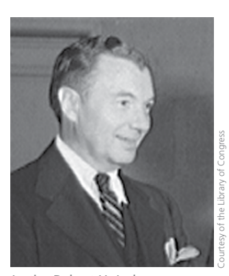
Justice Robert H. Jackson

that the Court had swept "aside the traditional right of religious conscience in favor of a compulsory conformity to a patriotic ritual." "The language" of the decision, he added, "reflects something of the intolerant temper of the moment."