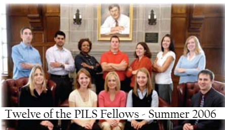
Twelve of the PILS Fellows - Summer 2006

Due to the joint efforts of the Public Interest Law Society [PILS] and the Marquette Law Alumni Association, the summer of 2006 witnessed fifteen students serving as Public Interest Summer Law Fellows around the world. 3 From the Task Force on Family Violence in Milwaukee to the Border Claims Commission in Eritrea, from the Cook County Office of the Public Guardian to the Office of the Inspector General at the U.S. State Department, the Fellows served with distinction, providing needed legal assistance to agencies dedicated to advancing the public interest. Their experiences were highlighted in the spring 2007 edition of Marquette Lawyer .