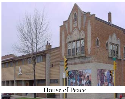
House of Peace