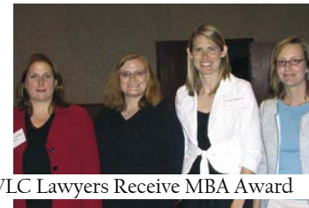
MVLC Lawyers Receive MBA Award