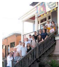
Students in New Orleans