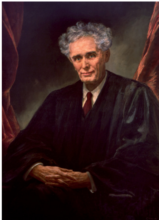
Portrait of Justice Louis D. Brandeis.

Leadership should come from those in high positions; it is inspiring to know that a man, writing opinions, so consummate from every standpoint, graces the highest tribunal in this country. Surely opinions such as his have seldom appeared in the reports of the Supreme Court or of any court. One should not be afraid to entrust the destinies of this nation to him. ■